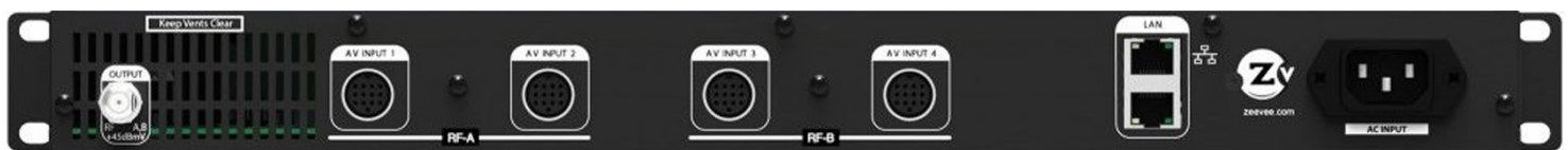
Coax Output AV Ports 10/100 LAN Ports AC Power Input